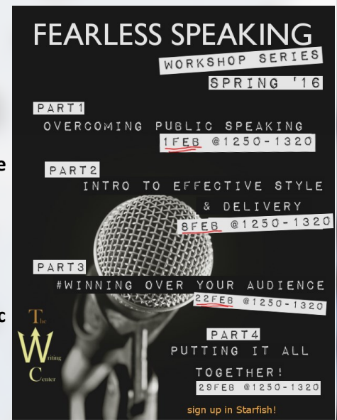
Sample workshop flyer from Spring

Director, The Class of 1963 Center for Academic Excellence